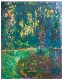
Water Lily Pond at Giverny

On December 5, 1926, Monet died at the age of 86 and is buried in the Giverny church cemetery.